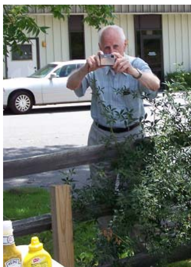
Jimmy Morgan captures the action

The Swainsboro Kiwanian (USPS 530-500) is published weekly by the Swainsboro Kiwanis Club, P.O. Box 3, Swainsboro, GA. Issue date July 15, 2008. Postmaster: Send Form 3579 to Swainsboro Kiwanis Club, P.O. Box 3, Swainsboro, GA 30401. Periodicals Postage paid at Swainsboro, GA 30401